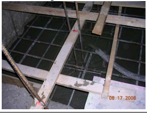
F5. Earthen Form Footing Pour

necessary because the earthen form method could be utilized as specified by the architect and engineer. The roof system demolition was done in a staggered line to eliminate the need for additional columns and girders. Only two W10x77 columns were installed and they were located at the north-most and south-most extents of column line "A."