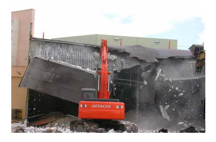
F7. Lightweight Concrete Roof Demolition

F6. West Wall on Ground before Saw Cutting