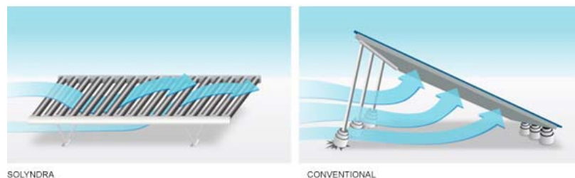
Figure 1: Solyndra Design

The installation of Solyndra PV panels would add to the sustainability of the Potomac Yard Land Bay E building and will help to reduce the energy consumption from the grid. Since this is a new technology of harvesting the sun's energy from 360 degrees by absorbing direct, reflected and diffuse sunlight. This is made possible by installing the solar array on top of the existing white TPO roofing membrane. An analysis would need to be conducted to analyze the cost and installation implications to the owner and the building. After gathering the cost and installation information for the products it would then have to be compared to the energy savings and increased sustainability to the building before a recommendation of the use of this product would occur. Another item that would need some attention when considering this system would be the constructability implications that would affect the building. A study would need to occur which would involve determining the weight of the product and its support system to see if it would have any structural impact on the roof of the building. If it was found that the roof structure would need to be upgraded that information would have to be considered in the decision whether or not to install the equipment.