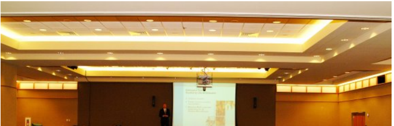
Figure 4-1 The existing lighting of the auditorium

One of the unique features of the Medical Office Building is its Auditorium. Located on the ground floor of the building, the auditorium is a general meeting place for stockholder conferences, employee workshops, and press conferences. The space is designed to be divided into three parts when necessary to allow for multiple smaller presentations, but is generally used as a whole space. The current lighting system of the auditorium (Figure 4-1) consists mainly of downlights assisted by recessed lighting in the coves to improve the light at the ceiling. This is a conventional and effective lighting solution to general use spaces such as this auditorium. However, a conventional system may not always be the best solution.