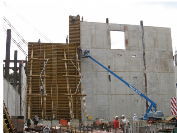
Figure 5.3: Pouring of concrete shear wall