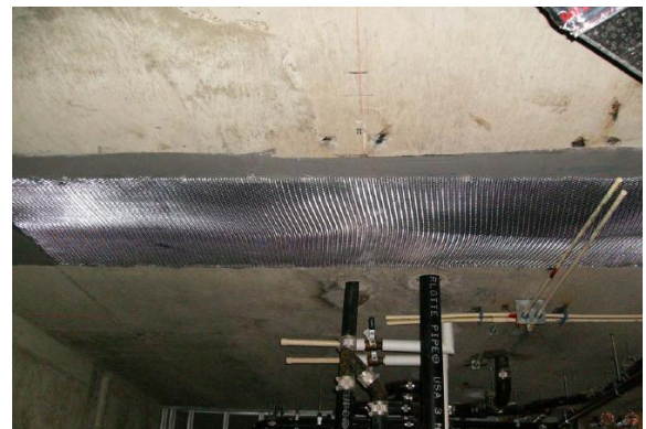
Fire proofed CFRP panel on underside of slab

The issue is to determine if the original riser spaces are adequate for use as a centralized distribution system supplying the individual units rather than using consistent slab penetrations for risers. Risers that can be consolidated must be identified and basic information evaluated. Basic mechanical sizing of supply/return/waste lines will need performed to estimate size of consolidated risers and main distribution piping for a typical floor. The purpose of the mechanical resizing is to determine the feasibility of the existing riser areas to house the new risers. If the existing is not acceptable, consolidation to a lesser number of openings may provide the ability to avoid structural reinforcement. Also the location of the penetrations should be considered, and if the existing areas are not sufficient, strategic placing of new openings can prevent the use of structural reinforcement.