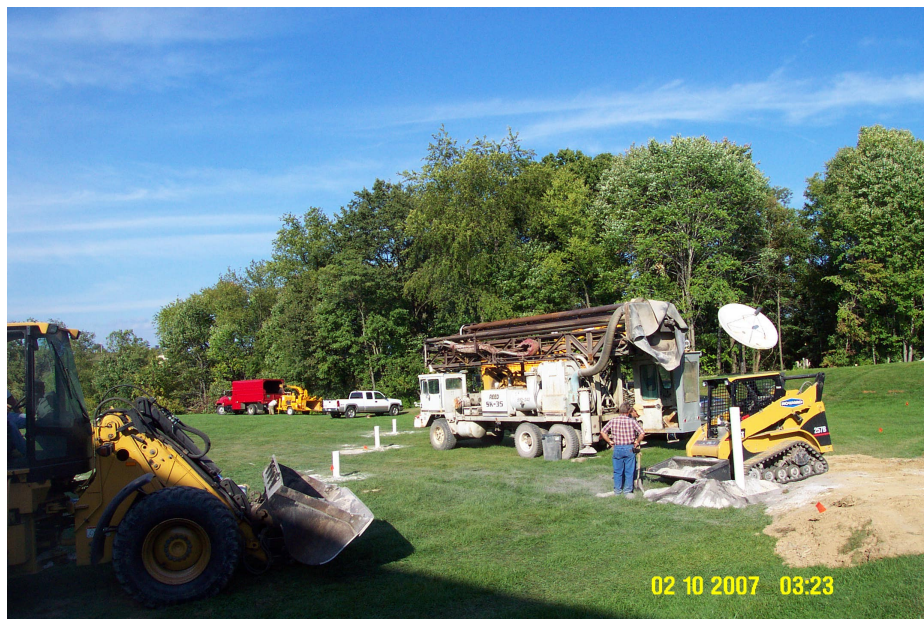
Figure 5: Mine grouting

Western Pennsylvania has several regions that were mined in the past and the site of Central Greene School District has some underground mines that needed to be stabilized. This part of the package was actually opted to be taken out and completed under a separate contract. For constructability reasons mine grouting needed to be taken as a factor. Mine subsidence is something that could cause serious damage to a building. Mines need to be stabilized to ensure that differential settlement does not occur in the foundation. Differential settlement can cause serious problem in a building and to the structural stability. Mines on the site at Waynesburg Central High School were stabilized before other construction began to ensure the structural integrity of the building. In the section titled Schedule Acceleration Scenarios explains the reason that the mine grouting was removed from the contract before bid.