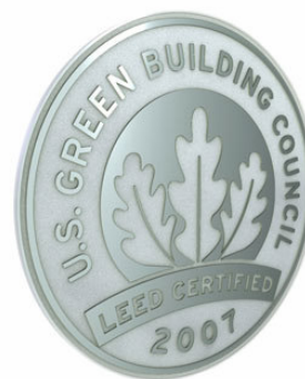
Figure 13: LEED certified logo

Central Greene School District did not set out to gain any LEED certification on the Waynesburg Central High School project. This is a point were I could do some research and see the necessary changes that would be made to attain a LEED certification. I will do this by first analyzing the feasibility of attaining different points, I will do this through a variety of methods one of which would be correspondence with professionals in the region that have completed LEED certified projects in the past. Another way I will determine feasibility of various LEED points is by doing research for the region as a whole to discover the options of things such as the availability to recycle materials. Recycling is a point of particular interest because Waynesburg Central High School is not an urban location so points like recycling and the public transportation may not be possible to attain. Part of the LEED analysis could easily incorporate one of my breadth topics by redesigning a portion of the mechanical system if necessary to attain a LEED point. After a thorough analysis of each possible LEED accreditation point the goal is to create a simple spread sheet to explain those points that are feasible and those that are unattainable.