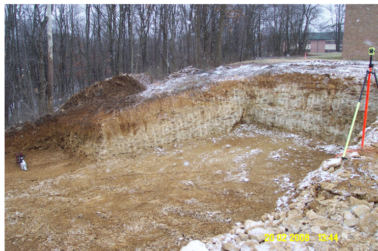
Figure 4: Excavation on building G

On any construction project the most critical phase to ensure completion on time is the excavation and getting the building out of the ground, this is where the most unknowns lie. At Waynesburg Central High School the project was no different except for the actual implementation of the drawings. Plans and specifications for Waynesburg Central High School called for spread footings 7' to 8' deep. During the excavation rock was