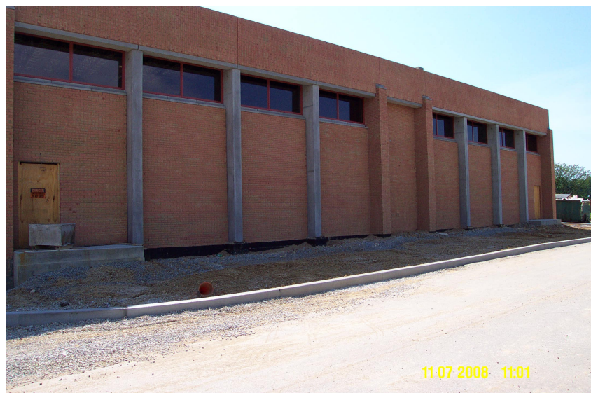
Figure 8: Finished exterior of new music suites

on to the project late this could have been an area where the owner could have saved some money and the contractors could have saved some headaches. This is the value of having a construction manager on the project because they understand the process in which systems are installed as well as various ways to achieve the same results all the while saving money.