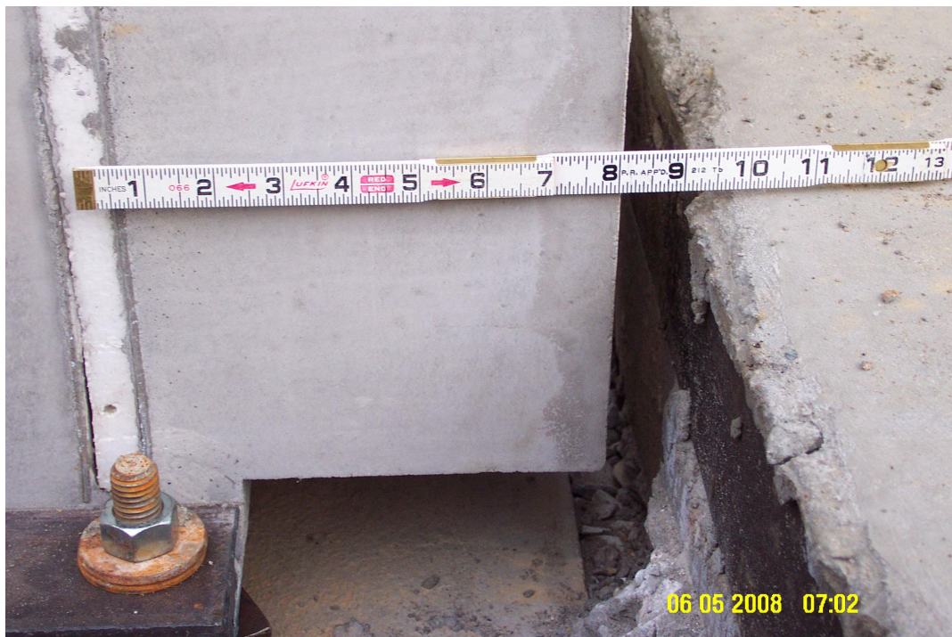
Figure 12: Offset precast concrete column

concrete masonry units and still be able to tie brick into the groove. Concrete masonry units with face brick were still used as infill between the columns. As a result of the offset a different method of tieback was used at the edges butting a column. The offset in the precast concrete columns not only resulted in the changing connection between brick and column but also effected the connection to the open web joists resting on the beams. Since the bottom cord on open web joists always has extra that does not