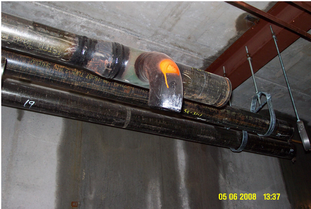
Figure 11: Foreign pipe marked in orange

Contractor performance needs to be monitored at all times on a construction project. Waynesburg Central High School is no different. Some contractors need to be monitored more closely than others to ensure work is being performed in concordance with plans and specification. A situation arose on the project where shut off valves were not installed in the system where marked on the