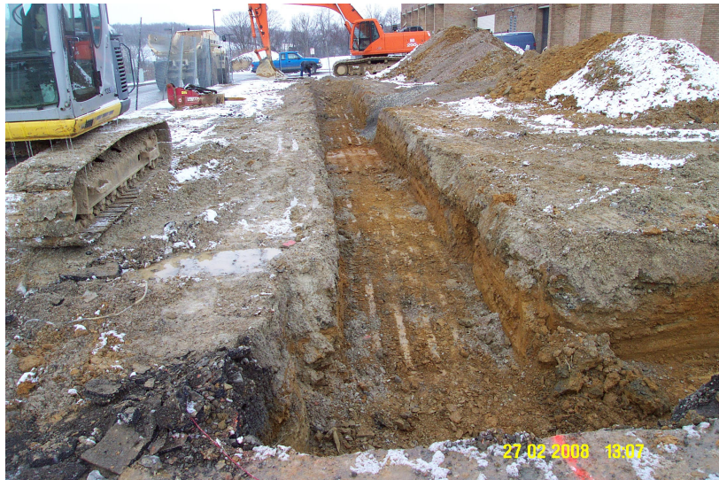
Figure 7: Shallow foundations of building F

Reducing the depth of the foundations created less material to be excavated which always leads to a time savings. In excavation the amount of time it takes to remove a given quantity of material is directly correlated to the properties of that material. In the case at Waynesburg Central High School the material that was encountered was rock, which is one of the most challenging materials to remove. Removing rock requires hammering which is very costly and time consuming. By reducing the depth of the foundation by approximately 4' as much as two weeks of hammering were cut off the excavation process.