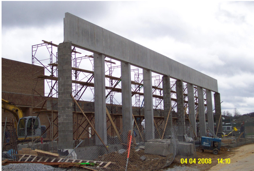
Figure 3: Precast concrete at building F

Congestion on a construction site is something that is to be avoided at all cost; it lowers productivity and also creates an environment that is less safe. Precast concrete did not alleviate any congestion on the site but actually caused increased congestion because of the dead men that needed to stay in place till the structure was stabilized. The dead men pictured in figure 2 and figure 3, show the amount of congestion caused. Scaffolding had to be built around the dead men in