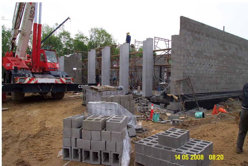
Figure 6: Precast concrete erection

Precast concrete on most construction projects is very quick to install resulting in shortened durations due to less work on site. In the case of Waynesburg Central High School the use of precast