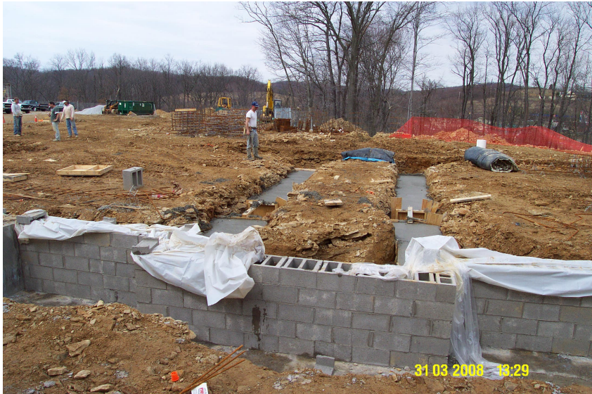
Figure 9: Shallow foundations of building G

be sure that it was the same as that which it was originally designed. The foundation calculations were all redone to ensure that nothing was being compromised when the height was decreased. The value engineering side of this example is the amount of money that was saved by reducing the depth and maintaining the structural integrity.