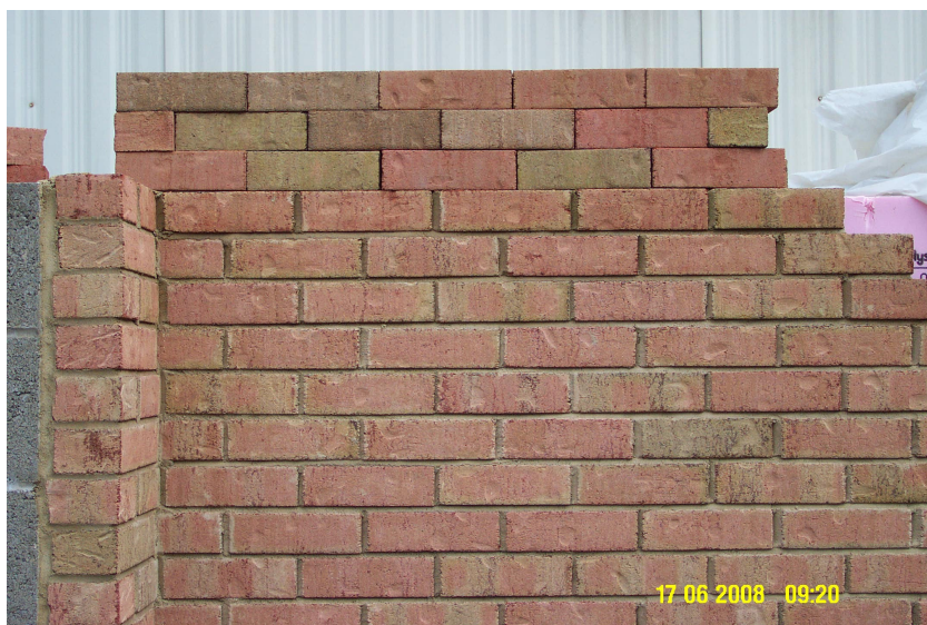
Figure 10: Top 3 courses new brick, bottom courses on building F

Through a series of meetings the issue was resolved and new brick was fired and delivered to site for installation. This process