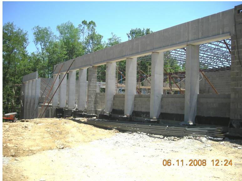
Figure 2: Precast concrete at building G

Waynesburg Central High School called for a performance specification on the precast concrete structural system, meaning shop drawings needed to be fabricated and approved before any of the members could be fabricated. This process caused further delay in the procedures at Waynesburg Central High School because you now need to wait after contracts are awarded to start the structural design. The project is not very large and proportional to the building there was very little excavation that needed to be complete before the structure was erected. Once the precast concrete is designed it then takes time to fabricate the pieces and at many fabrication which can take varying amounts of time depending on the number of projects being fabricated at the same time.