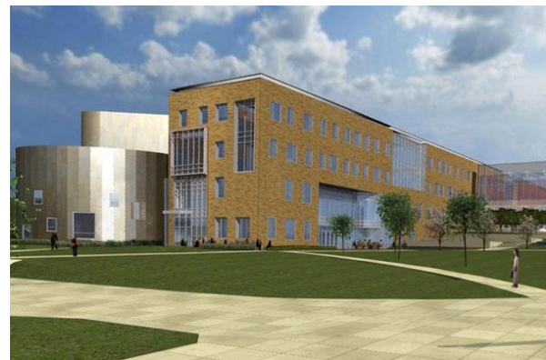
Figure 2: Northeast Elevation

The Northeast elevation showing the Proscenium Theater on the left, in Figure 2, is made up of stainless steel wall panels, backed up with concrete and steel studs. The remaining building elevations