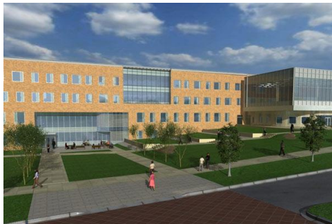
Figure 1: North Elevation

An interesting aspect of the PAHF is that it's comprised of multiple structural features. The exterior façade of the building consists of an assortment of materials creating a strong relationship with the