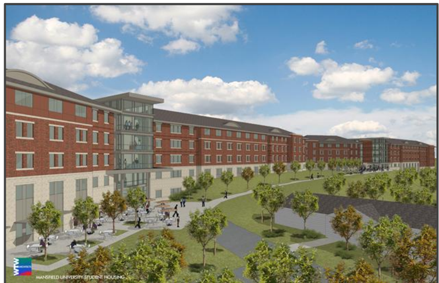
Figure 1: Rendering Courtesy of WTW Architects

To adhere to the architecture of the surrounding university, the majority of the façade of Building A consists of face brick with a base of ground face concrete masonry units. To complement the brick and masonry units, precast window heads and sills can be seen at each suite window and maroon and gray metal panels can be seen throughout the building as well. In the central core, glass storefront walls can be seen complementing the façade of the brick wings. Traditional to the brick wings, a hip roof with asphalt shingles was used and sticking with the modern feel of the glass storefront walls, a flat roof was utilized over the central core.