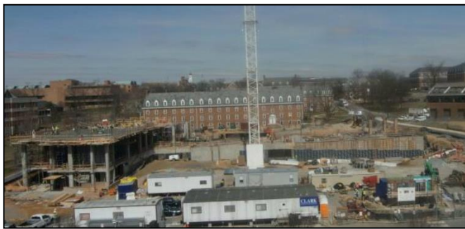
Figure 1: Current Superstructure

The super-structure of Prince Frederick Hall is currently cast-in-place concrete. This