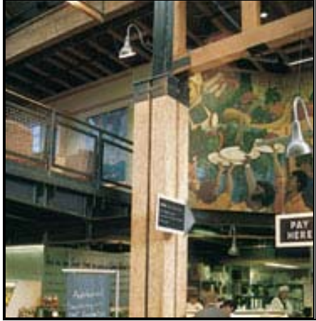
Figure 32: Engineered Wood Column Sample 4

The appearance of the floor system from below is also an influence on the interior architecture of the space. The use of pre-cast concrete members would create a lighter ceiling color and thus would make the plenum and faux ceiling more noticeable. In order to keep the desired interior scale the concrete would most likely be required to be painted black. The wooden framing option would not require any additional finishing.