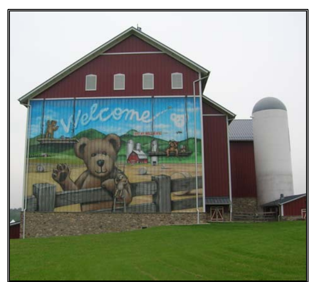
Figure 29:Exterior Mural 1