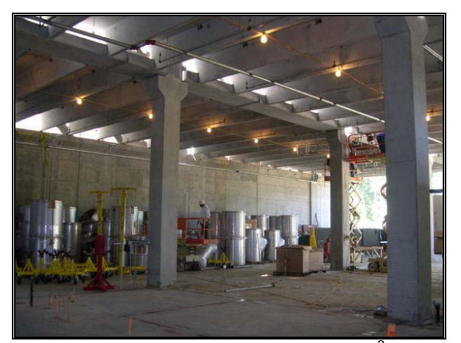
Figure 31: Pre-Cast Column Sample 3