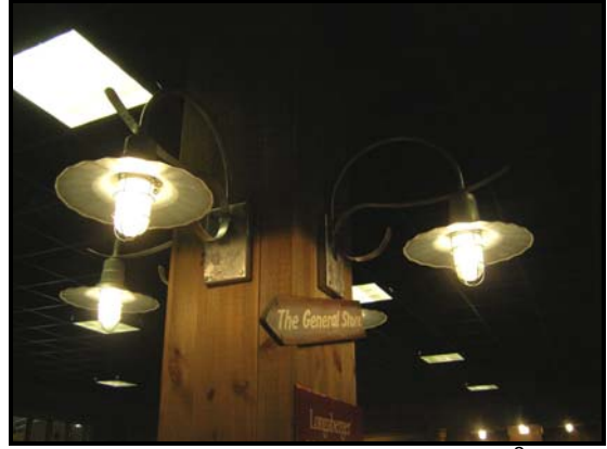
Figure 30: Examples of Steel Tube Columns Disguised as Wood in Situ <sup>2</sup>