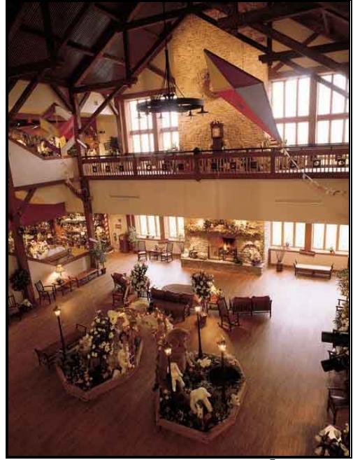
Figure 28: Central Atrium <sup>5</sup>

It is most important that the retail and support areas of the building be as functional as possible while still balancing the country barn aesthetic.